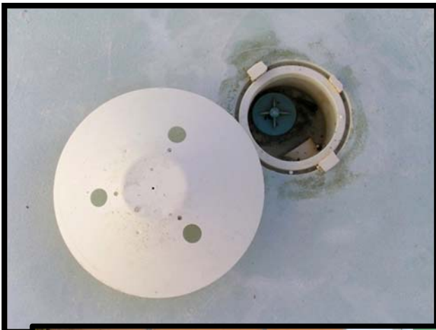
Fig 1: Typical hydrostatic valve assembly

To help reduce this pressure differential there are hydrostatic valves fitted in the deepest part of most pools.