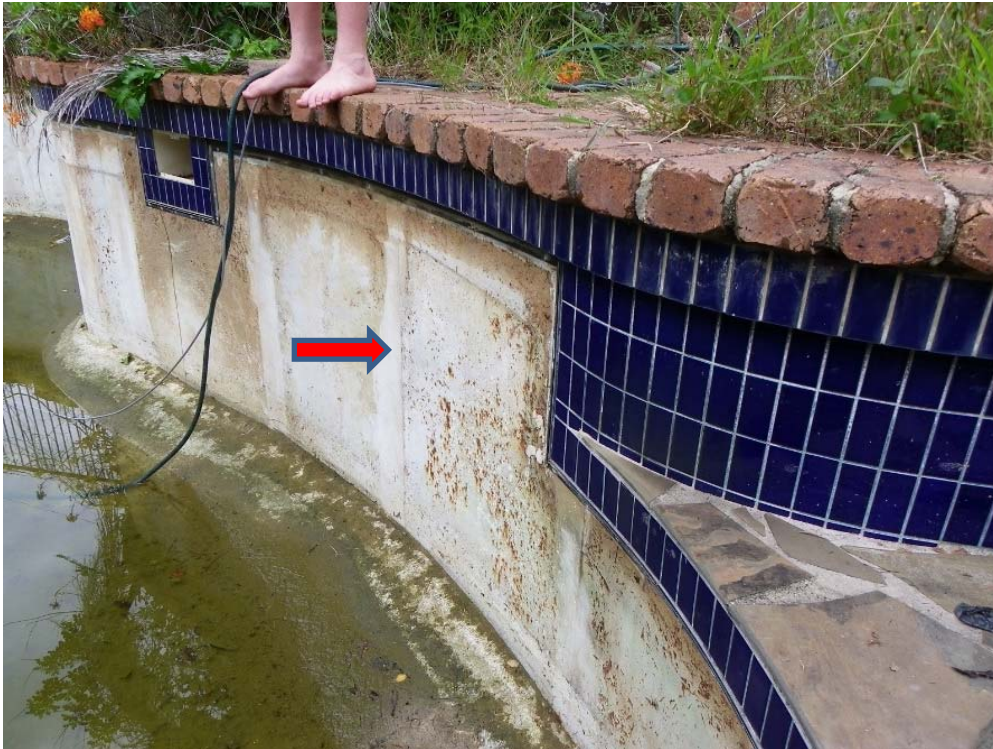
Pic 2 Depending on the shell construction upgrading with a coating (PaintnForget) is a better and much less expensive way to get the pool back into service.

However , if the shell is of panel construction, then usually only an expensive liner can be reinstalled. Here we can see the panel joints (vertical lines) every metre along the wall, (arrow) meaning it probably can only have a new liner installed.