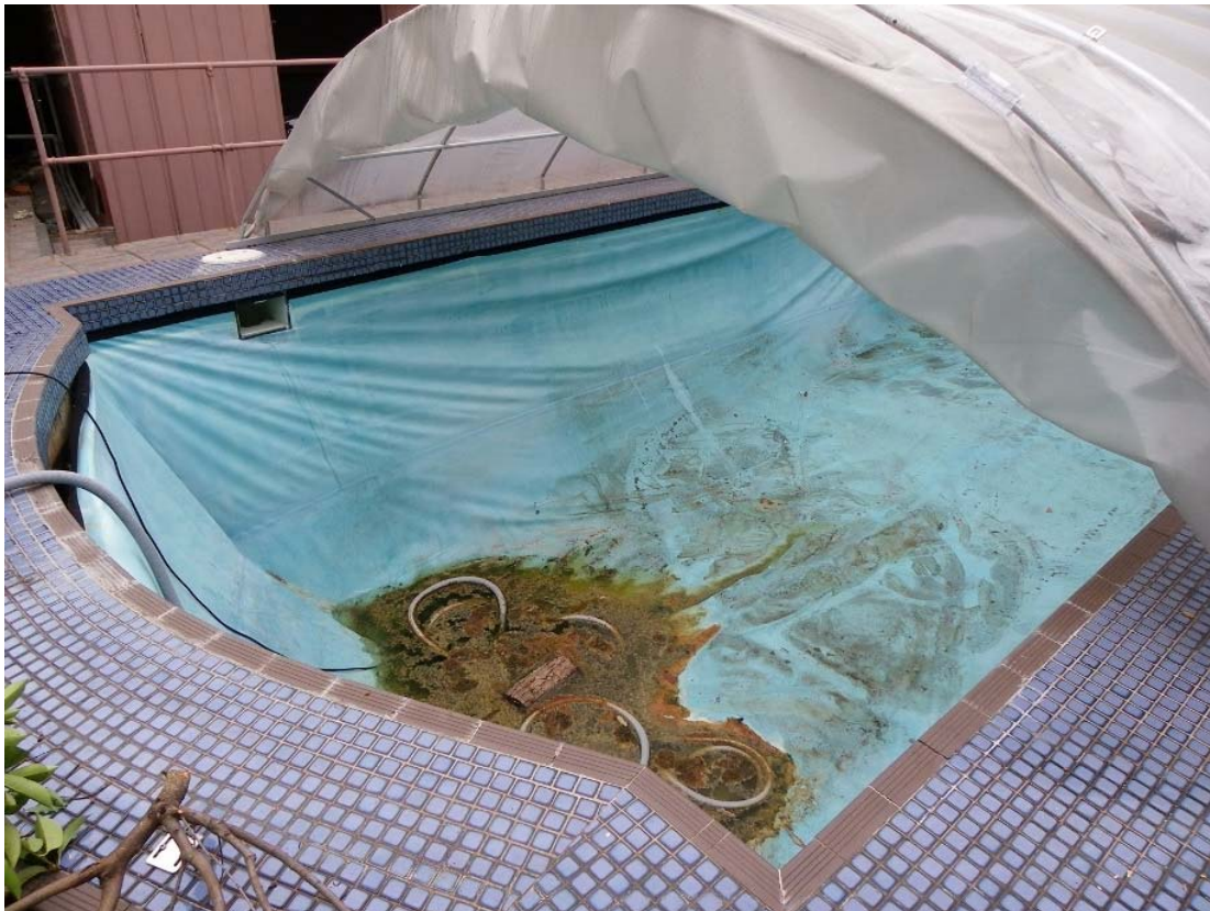
Pic 1. Here the liner has broken away from the fastenings and torn. Also, water has now got behind the liner making it difficult to use and providing an unhealthy water situation.

The vinyl liner is made to measure and fastened only along the top. The liner should be made of the highest quality material and thickness to last. However, any puncture renders it useless. Repairs to vinyl liners are difficult to make long lasting. Over time the liner fades, becomes brittle and usually fails so that they become an eyesore and the pool becomes unusable.