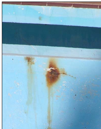
Crack with rust stains.