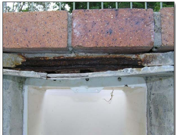
Check the metal plate above skimmer box