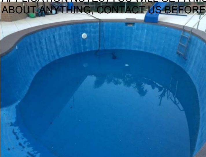
Figure 1. Vertical banding as no L to R spreading, only vertical.

BY FOLLOWING THE KEY ASPECTS DETAILED ABOVE (AND THOSE IN THE APPLICATION NOTES) YOU WILL GET A MUCH BETTER OUTCOME. IF NOT SURE ABOUT ANYTHING, CONTACT US BEFORE YOU START